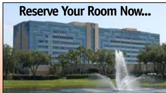
Renaissance Orlando Airport Orlando, Florida

This request is totally voluntary and not a pre-requisite to meeting attendance.