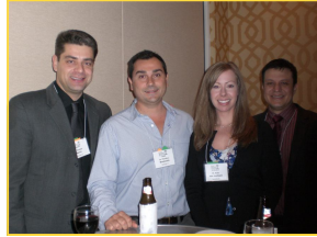
The FAP Welcome Reception on Friday always provides a great time to relax and catch-up with friends.