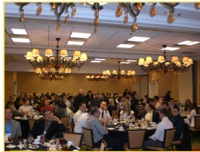
Members enjoy lunch during the FAP General Business Meeting.

By the numbers... 29 Exhibitors 6 Residents' Presentations 126 Attendees 6 New Members